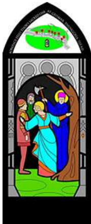
Location 5: Newcombes Meadow