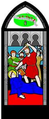
Location 7: East Street Junction