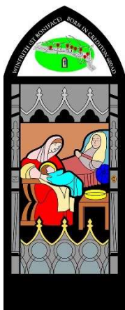
Location 1: St Lawrence Green