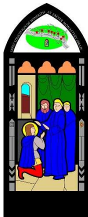
Location 2: Congregational Church